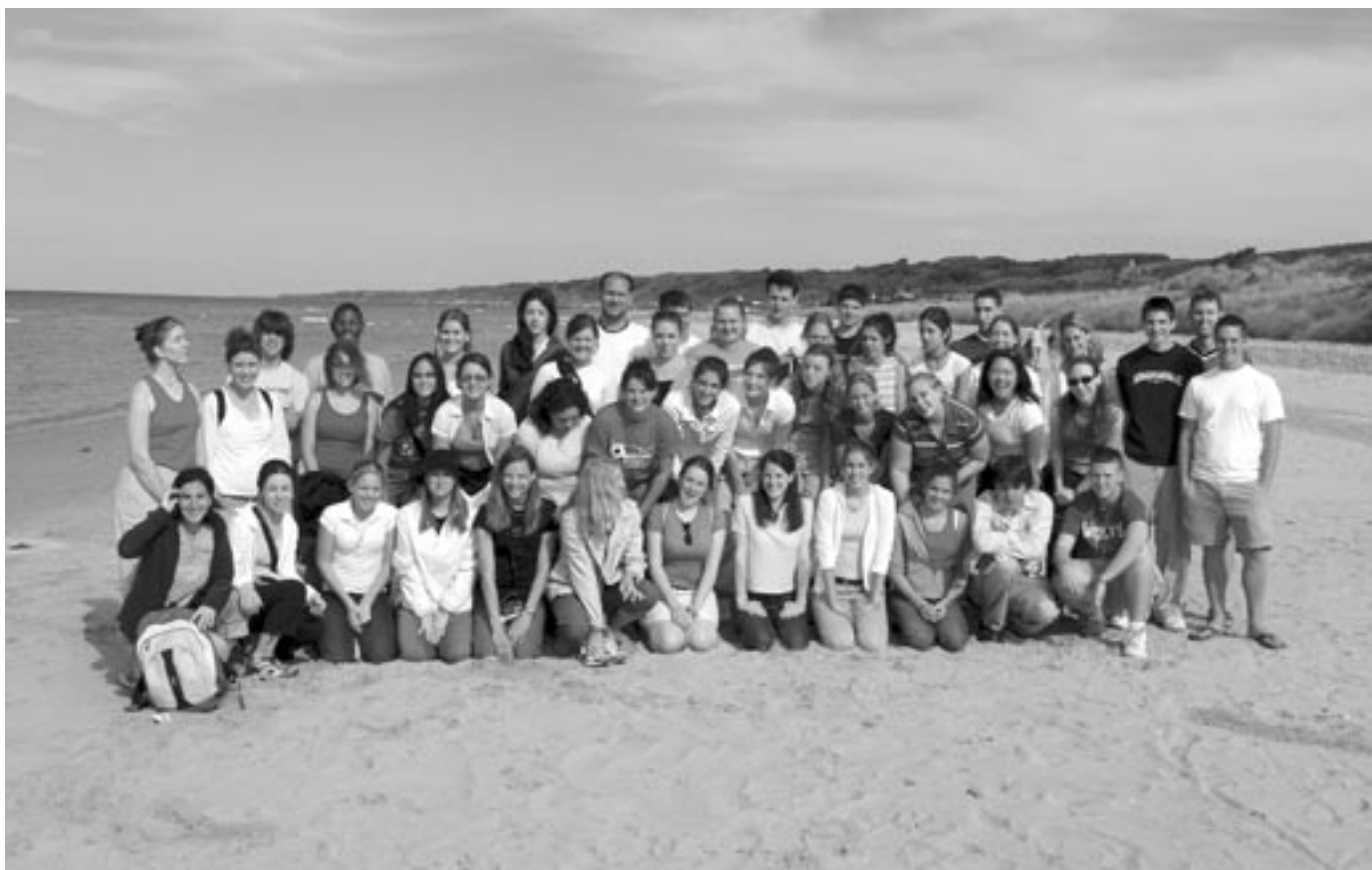
Students from two Ohio high schools (Worthington Kilbourne and Upper Arlington) participate in a military history study tour across Europe. Here, the students visit Omaha Beach in France (they are also seen on page 354 in Paris) in June 2004.

When the study of slavery in the Americas is taught in the context of human rights, students no longer see the